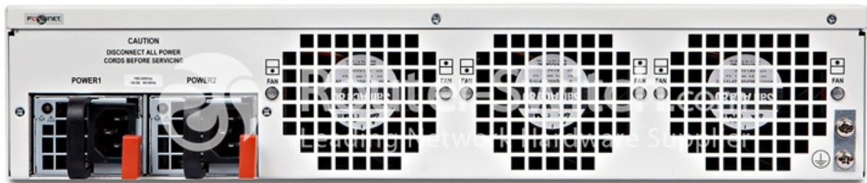
Figure 2 shows the rear view of FG-3000D.